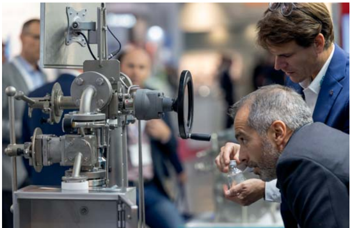
Valve World is an excellent place to encounter the latest technologies.