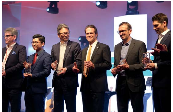
Valve World was kindly sponsored by Rotork, Neway, KITZ, MRC Global, Emerson, and Velan.