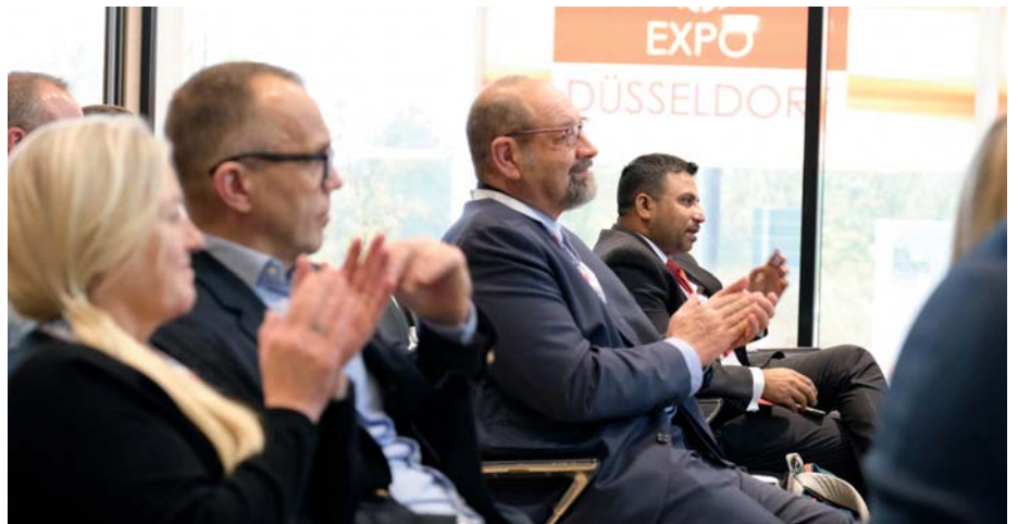
The presentations attracted lots of technical experts.