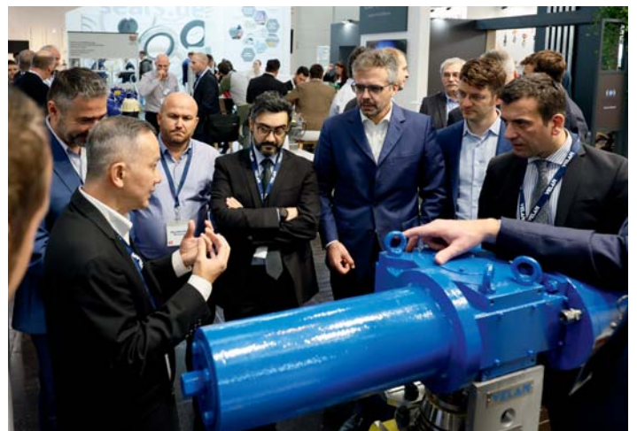
Event sponsor Velan presented a range of its gate, globe, check, ball, triple offset, and engineered severe service valves on its expo stand.