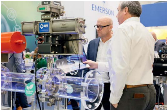
Event sponsor Emerson displayed advanced technology at their stand.