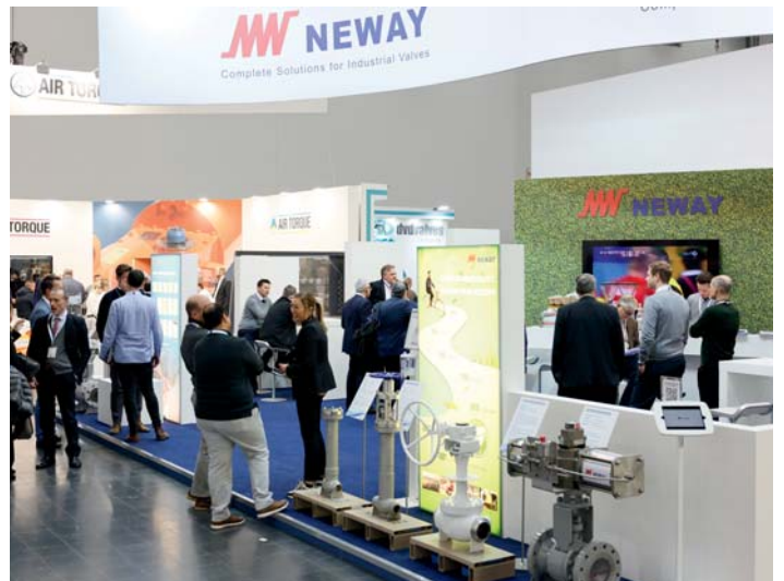
Event sponsor Neway's stand attracted a lot of interested attendees.